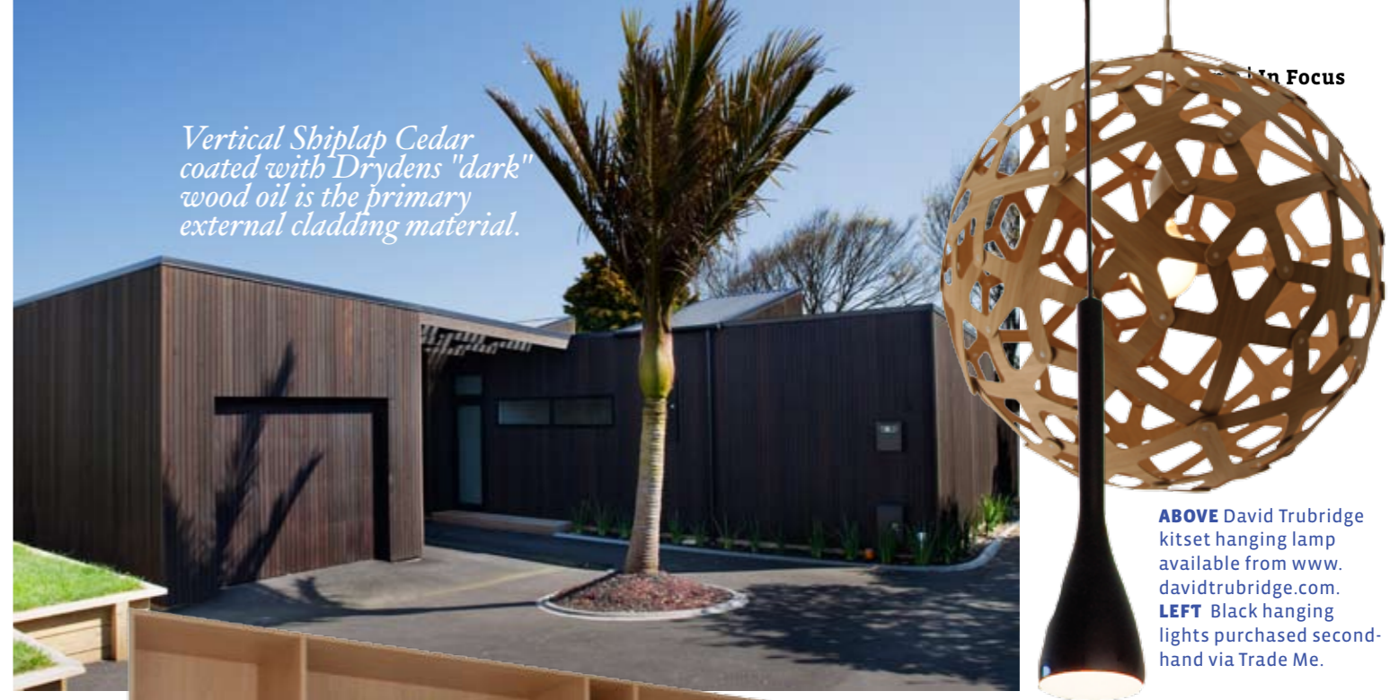
Vertical Shiplap Cedar coated with Drydens "dark" wood oil is the primary external cladding material.